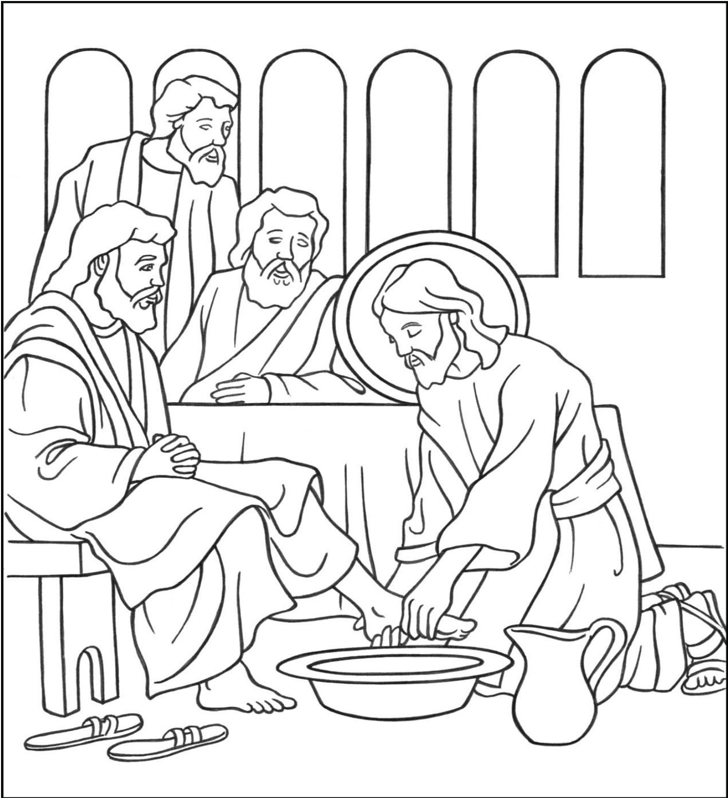
Jesus Washing the Apostles' Feet - © TheCatholicKid.com